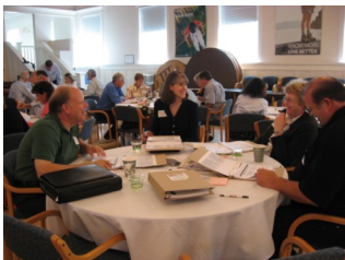
Participants at the Oregon Healthy Food in Health Care Fall 2009 Roundtable hosted at Kaiser Permanente Interstate, Portland, OR.