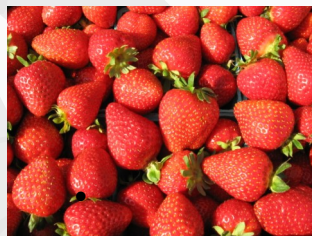
Local strawberries from Kaiser Permanente's Interstate Farmers Market

Special thanks to our funders for making the Project possible: Health Care Without Harm, Kaiser Permanente-Community Benefits, Multnomah County