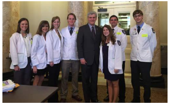
SPSR MEMBERS FROM UNIVERSITY OF MISSISSIPPI MEDICAL SCHOOL meet with Governor Phil Bryant.