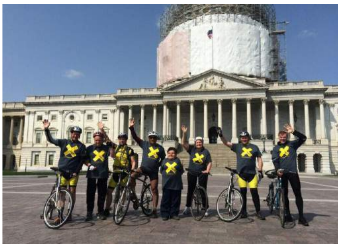
COALITION PARTNER BIKERS FOR PEACE , which includes PSR chapter staff members, rallies at the U.S. Capitol before riding to NYC for the Nonproliferation Treaty Conference. The organization created a winning Nukebuster film.