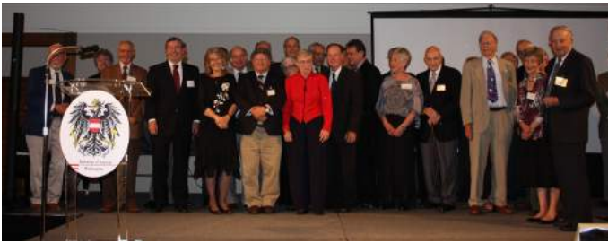
CAPSTONE MEMBERS , those with 25 or more years with PSR, are feted onstage at the Gala for Peace & Health in September.